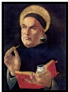
St. Thomas Aquinas

“We must love them both, those whose opinions we share and those whose opinions we reject, for both have labored in the search for truth, and both have helped us in finding it.”